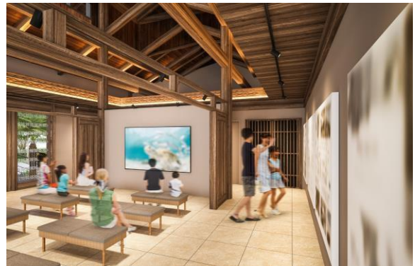
Image representation of Nature Center