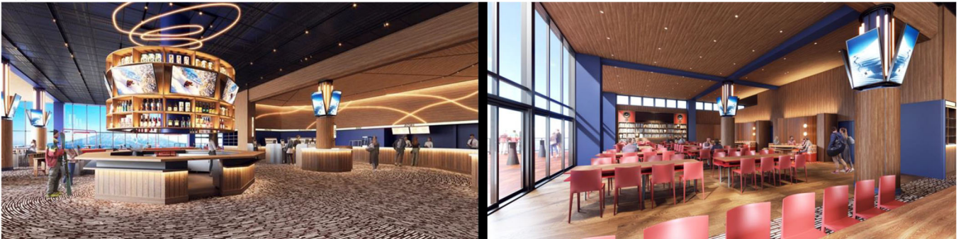
New restaurant (image representation)

The new restaurant to open on the second floor of the Ace Gondola mountaintop station building during the 2025-2026 season will be in a location with an altitude of 813 m that offers one of the slopes' most outstanding views, one that faces Mount Yotei from the front. At the new restaurant, plans for content that will enable guests to fully enjoy the mountain resort are currently underway, including the placement of a terrace with pristine scenery that makes guests feel like they could dive right into Mount Yotei, an open kitchen to convey the feel of a live performance, an island bar counter for guests to enjoy après-cafe time and seating that reuses chairs from “Center Four,” whose operation ended last season. Additionally, the interior and exterior decorations are scheduled to contain recycled materials and other environmentally-friendly building materials. Guests will be served premium meals and provided the ultimate relaxing time in this natural nest where they can rest their wings for a moment while feeling Mother Nature’s presence in Niseko up close.