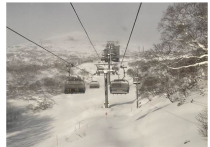
Ace Lift #3 (Scheduled for 2026-2027 season)