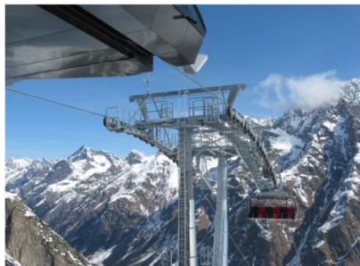
King Lift #3 (image representation) (Scheduled for 2025-2026 season)