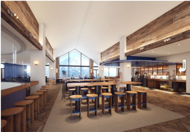
“sanshoku” restaurant & bar (image representation)

“Tanta · an,” the restaurant & café on the second floor of the King Area Mountain Center, will be remade into and reopened as “sanshoku,” a restaurant & bar. Guests will be able to savor meals and beverages at any time of the day, be it morning, lunchtime or après-ski, while taking in panoramic views of Mount Yotei and the expansive slopes visible from the mountain foot. Flexible space and service that befits this entranceway to a mountain resort will be served to match visitor needs that change over time. Note that during the 2024-2025 Winter season, the restaurant will be operated on a pre-open basis, with its total renovation and reopening scheduled for the 2025 Summer season.