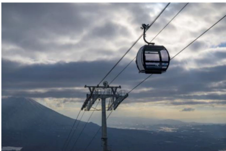
Ace Gondola (2024-2025 season)