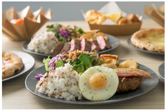
Menu (image representation)