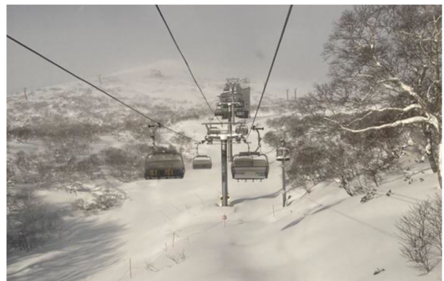
Existing King Lift #3