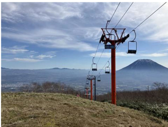
Ace Lift #3 (existing lift)

At Niseko Tokyu Grand Hirafu, King Lift #3 was remade into a high-speed lift that seats four in 2016 due to an increase in guests from around the world seeking JAPOW (a coined word derived from Japan + Powder + Snow), conspicuously large numbers of people waiting for the lift mid-slope, and a revision that was conducted of flow pathways from the King Gondola. However, guest numbers are trending upwards year after year as exemplified by that number hitting a historical high during the 2023-2024 season. With this, plus the opening of the new “Ace Gondola” that seats ten this season, guests who make their way to mid-slope are anticipated to increase even further. As a means of further reinforcing transport capability, Ace Lift #3 will be updated to a hooded lift that seats four in order to double that existing capacity, thereby helping to alleviate mid-slope congestion and improve customer satisfaction. Additionally, under this plan, carriers, electrical equipment and other elements removed in the replacement of the King Quad #3 announced in August 2024 as the third entry in the “Value up NISEKO 2030” project will be reused to help reduce the footprint on the environment.