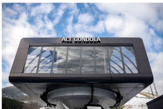
Ace Gondola mountain foot station building